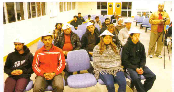
Auckland - NEW ZEALAND .. 12 th to 15 th September, 2012