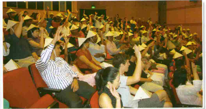
SINGAPORE .. 5 th September, 2012