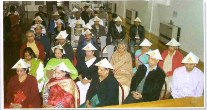
Melbourne - AUSTRALIA .. 8 th to 11 th September, 2012